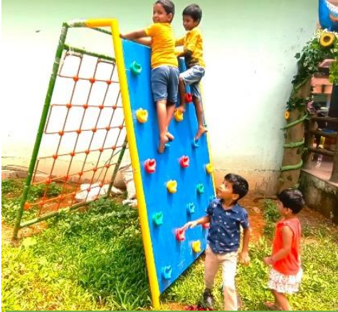
Rope & Foot Climber (NC-42) LLLDP Rock Climber+ Ball One Inch Nylon Rope + FRP Sheet Price = 55,250 Rs