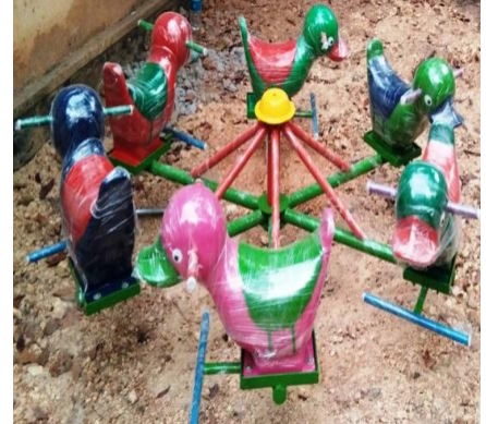
Merry Go- 6 Seat Fixi- 5.5 FT (M 37) 40 , 25 ,20 mm GI Pipe + FRP Price = 42,950 Rs