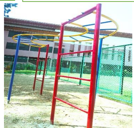
Horizontal -Ladder (SL-23) 50,25,20 mm Gi Pipe H -8 x L 10 Feet Price = 29,650 Rs