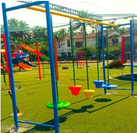
Balancing- swing (BC- 35) H 10 x w 3 -Foot 2 Feet 50,20 mm Gi pipe Price = 49,750 Rs