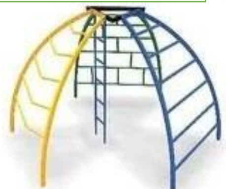
Rock Climber- ROC- 33 H 8 X W 12 / 25,20 mm Gi Pipe Price = 44,650