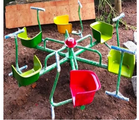
Merry Go-6 Seat Fixing-( M-27) 40 , 25 ,20 mm GI Pipe + FRP Price = 29,950 Rs