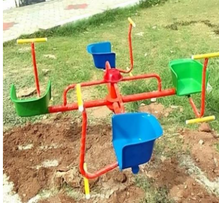
Merry Go-4 Seat Fixing ( M- 20 ) 40 , 25 ,20 mm GI Pipe + FRP Price =25,950, Rs