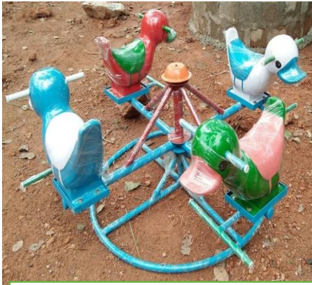
Merry go- PORTABLE (M-37) 40 , 25 ,20 mm GI Pipe + FRP Price = 39,950 Rs