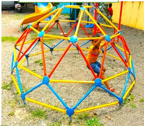
Sun Moon Climber-4 x 10 (MC-35) 20 mm Gi Pipe 6 mm MS plate 20 mm Gi Pipe+6 mm MS plate Price = 39,650 Rs