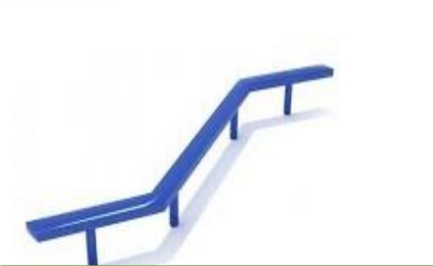
Balancing Beam ( OS -10 ) H 1 x L-10 Feet, /65,,40 mm Gi Price = 12 950 Rs