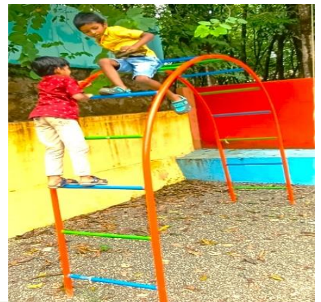
Rainbow Climber (RC-11) H 6 x L 10 Feet 25,20 mm GI pipe mm Price = 13,500 Rs