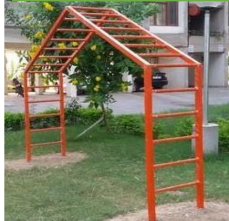
House Ladder-( HL-20) H 8 x L 10 2x2 Sq Tube + 20 mm Gi Price + 27,950 Rs