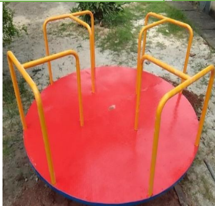
Merry go – Platform ( M 40) 40 , 25 ,20 mm GI Pipe + 45/6 mm MS Angler + FRP Sheet Price = 48,250