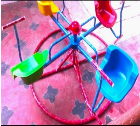
Merry Go -PORTABLE (M-23) 40 , 25 ,20 mm GI Pipe + FRP Price = 27,950 Rs