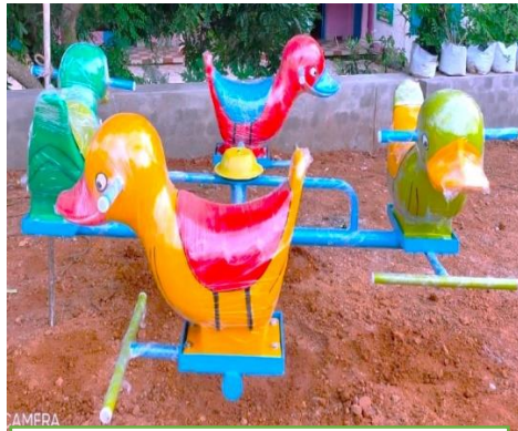
Merry Go- 4 Seat DUCK- (M-33) 40 , 25 ,20 mm GI Pipe + FRP Price = 36,650 Rs