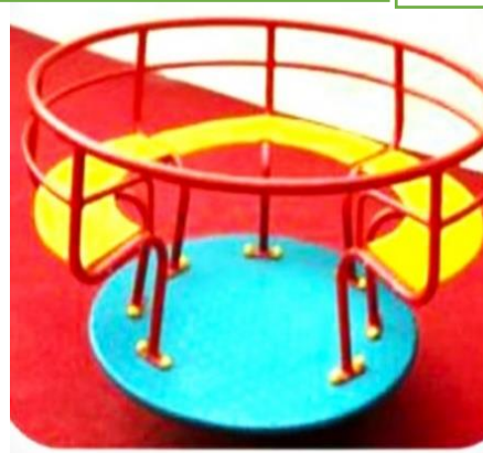
Merry go Round – SITTING ( M 42) 40 , 25 ,20 mm GI Pipe + 45/6 mm MS Angler + FRP Sheet Price = 58,750